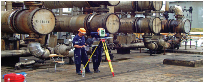
Laser surveying in action at the Sisak refinery using a Leica Total Station.

Numikon first analyzed INA's drawing specifications and configured the Isogen component of CADWorx Plant Professional to ensure that all the deliverables met the company's drawing standards, and completely fulfilled the customer's requirements.